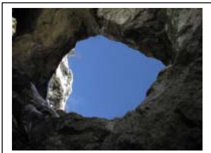
View from the arch

As the name implies, we are unique, different from other mineral clubs, and try to emphasize this difference. Most of, but not all of, our members already have a basic knowledge of minerals and usually are members of one or more unspecialized mineral clubs.